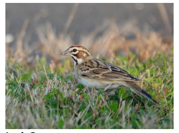
Lark Sparrow, Fairfield County Jo Fasciolo, 27 Oct 2023