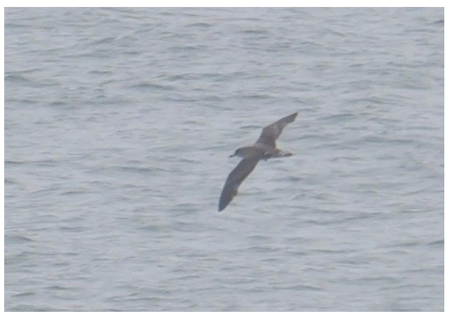
Cory's Shearwater, New London Ferry to Orient Point, CT side, Russ Smiley, 24 July 2024