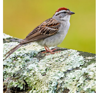
Chipping Sparrow, Middlesex County