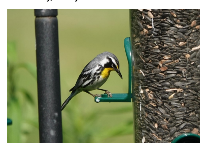
Yellow-throated Warbler, Bent of the River Sanctuary, Southbury Jo Fasciolo, 18 June 2024