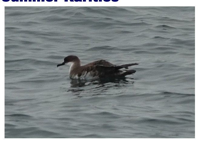
Great Shearwater, New London Ferry to Orient Point, CT side, Jo Fasciolo, 24 July 2024