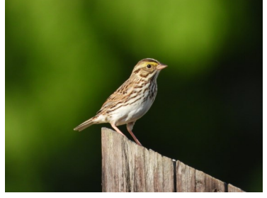
Savannah Sparrow, Hartford County, 2 June 2024

The spizella sparrows are much different in shape from Song and Savannah. They are smaller birds that are more attenuated and longer tailed. Our most common spizella sparrows, Chipping and Field, can be told apart by facial pattern and bill color. The rest of the common sparrows are pretty straightforward in terms of identification.