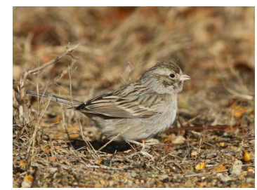
Brewer's Sparrow, New Haven County Bob MacDonnell, 25 Nov 2023

habitat steadily declined, it has become extirpated as a breeder. Notably, there are two recent summer records just outside of New England on Staten Island, but it is unknown if they were attempted breeders or just wandering individuals. This bird's current breeding range is not that far away from CT, so it seems unusual that there are so few recent New England records. New York City, a rarity haven, has had multiple records in the past few years, so it's certainly a good possibility to find here. I think we're very overdue with the last record being from Greenwich just over 20 years ago, according to eBird.