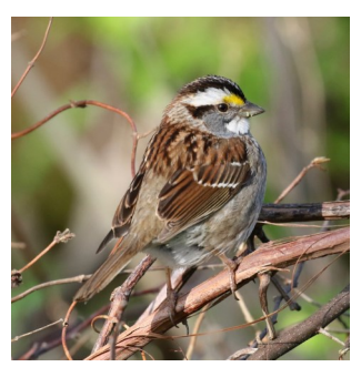
White-throated Sparrow, Fairfield County