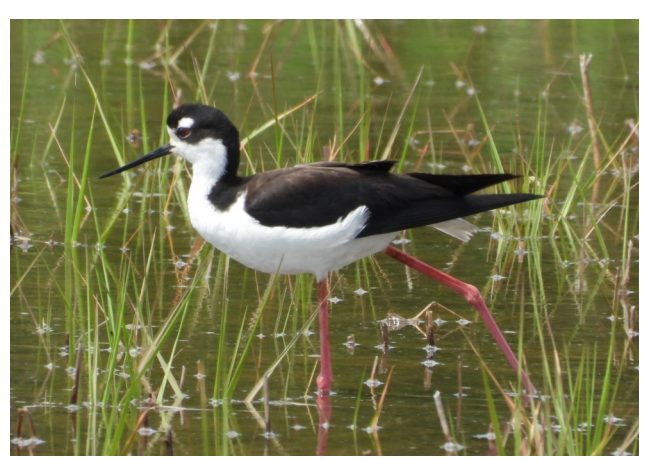
Black-necked Stilt Hammonasset Beach SP, Madison, Jeff Fengler, 7 June 2024