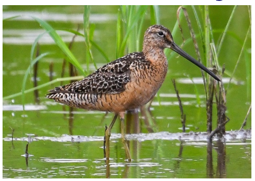
Long-billed Dowitcher Glastonbury Meadows (restricted access), Hartford, Bill Asteriades, 18 July 2024