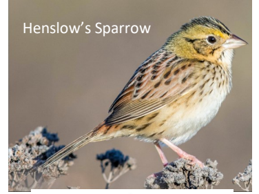
Indiana, April 23, 2017