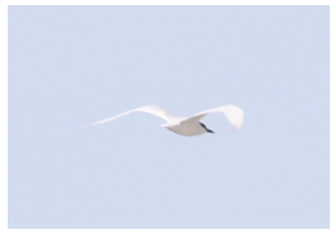
Gull-billed Tern Silver Sands State Park, Milford, 21 May 2024