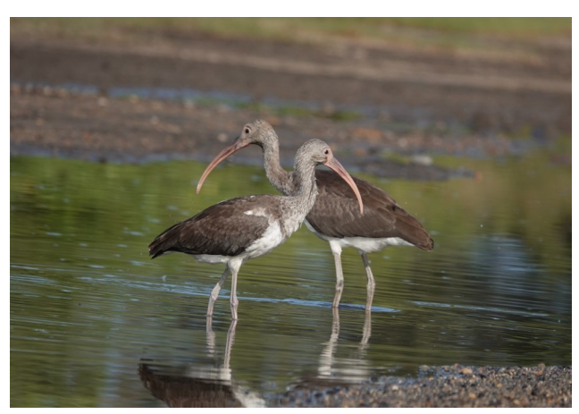
White Ibis Hammonasset Beach SP, Madison, 24 Aug 2024