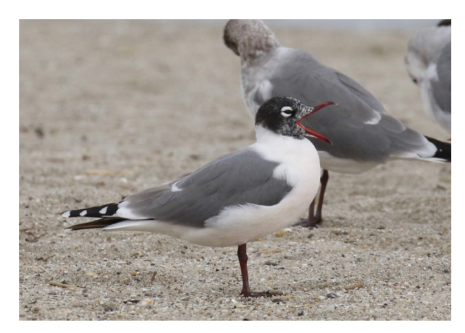
Franklin's Gull (one of 3 seen), Short Beach Park, Stratford, Frank Mantlik, 6 June 2024