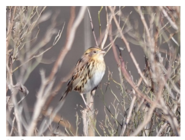
LeConte's Sparrow, Fairfield County, 13 Jan 2024