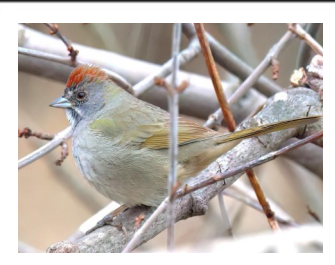
Green-tailed Towhee, Fairfield County